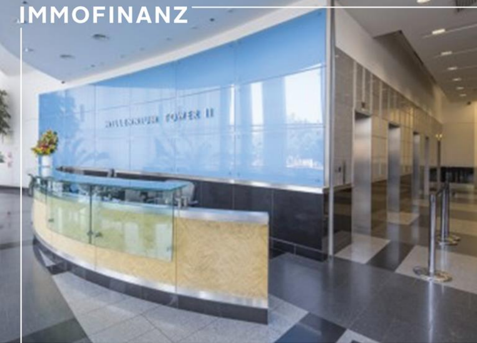
Polus Towers spoločné priestory pred rekonštrukciou